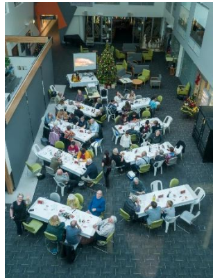
The Atrium from above