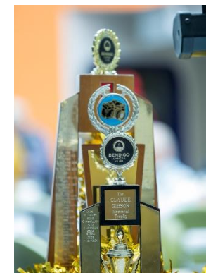
Not a fortune, but better than gold!