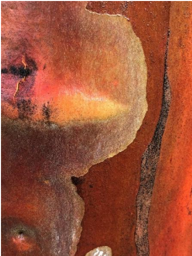
Image Below - A tree at the Deniliquin Golf course