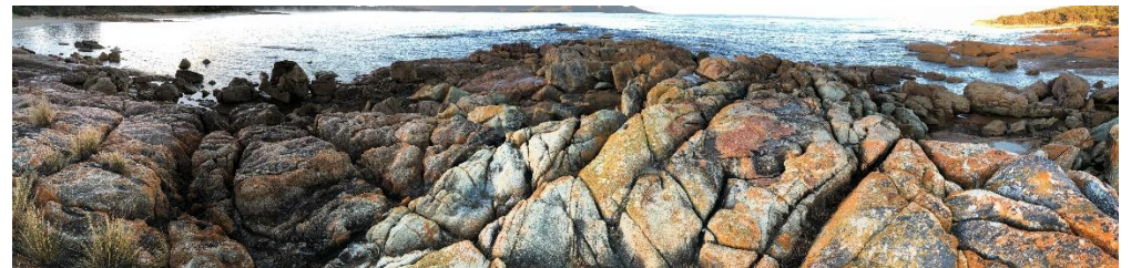
Image Below - Bay of Fires, Tasmania.

My equipment was all Pentax screw mount until I upgraded in 2011 to a Cannon 60D.